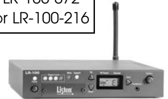
LR-100 shown with security cover and antenna in place

Listen's LR-100 Stationary Receiver / Power Amplifier is a stationary auditory assistance receiver with a built-in power amplifier. When used with a Listen transmitter, the LR-100 can deliver high quality audio for use in a variety of locations. The built-in 15 watt power amplifier (15 peak, 10 RMS) can be used to either amplify the receiver audio, or it can be used independently.