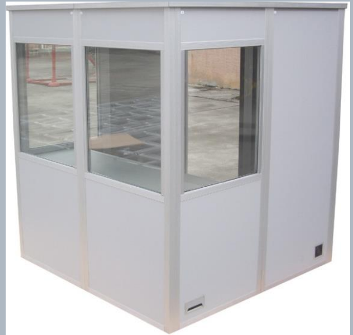
2-Person Booth $375/day or $1125/week

The booths include a working table, 2 roof ventilation units, and cable conduits in the front and back sidewalls for ease of running power strips, as needed.